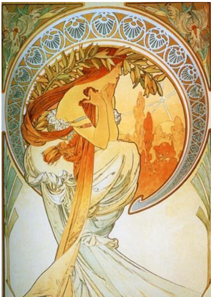
Alphonse Mucha, Poetry , 1898, lithograph.